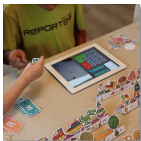
The App Every Classroom Should Have

Games4Gains.com brings you lots of teaching ideas and resources to make learning fun in your classroom! Here are some of our most popular posts: