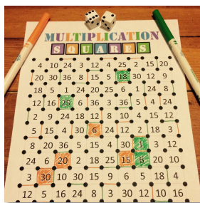
We've "Mathified" The Squares Game